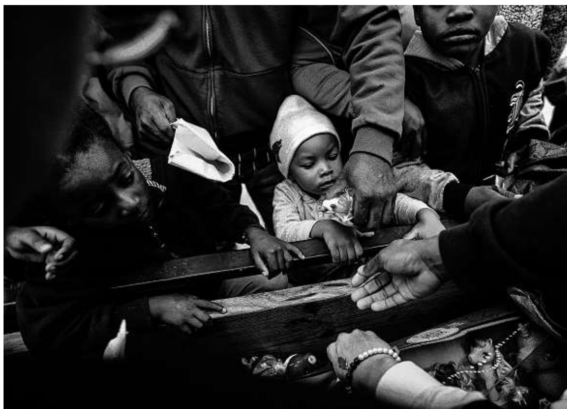
Haitian children hope to get a toy from the back of a trailer brought by the United America Outreach nonprofit from San Antonio to Ciudad Acuña to deliver the items to the migrants.

foreigners think that we’re all the same,” he said in Spanish, referring to the stigma of being a Haitian migrant. “This is the time when we (Haitians) need to present ourselves differently.”