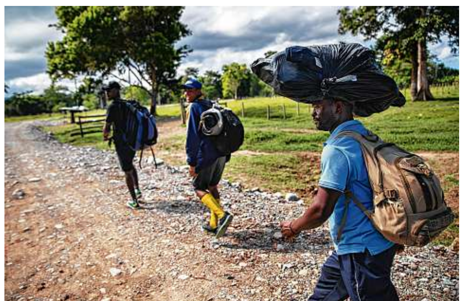
Migrants walk about four hours from the coast of Acandí to Las Tegas camp on Nov. 5 in Colombia. The following day, they will start a trek to Panama.