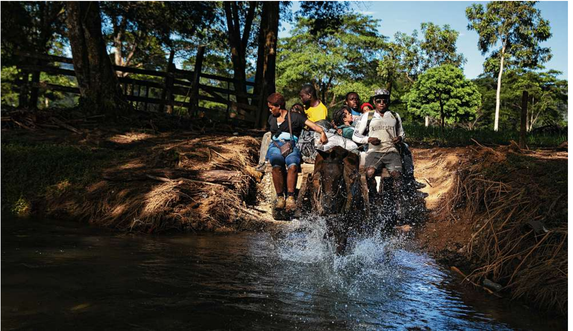
Migrants fortunate enough can pay for a carriage ride in Acandí to Las Tegas camp before heading into the Darién Gap. About 90 migrants stayed overnight Nov. 5.