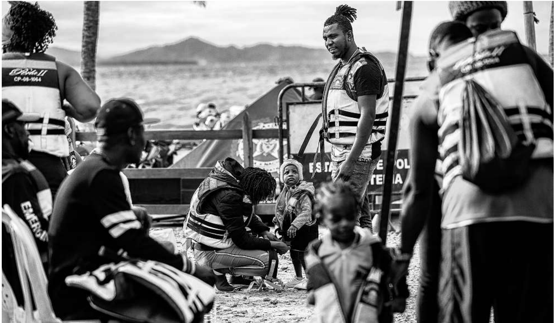
A child gets zipped up in a life preserver before boarding a boat from Necoclí to Acandí in Colombia as migrants start their journey to the Darién Gap on Nov. 4.