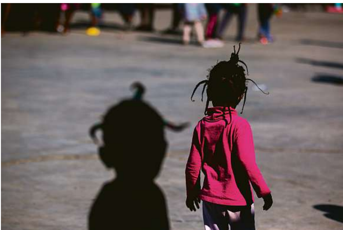
Mexico saw a 773 percent increase in Haitians seeking asylum in 2021, nearly 52,000 people, along with nearly 7,000 Chileans who are children of Haitians, according to COMAR.