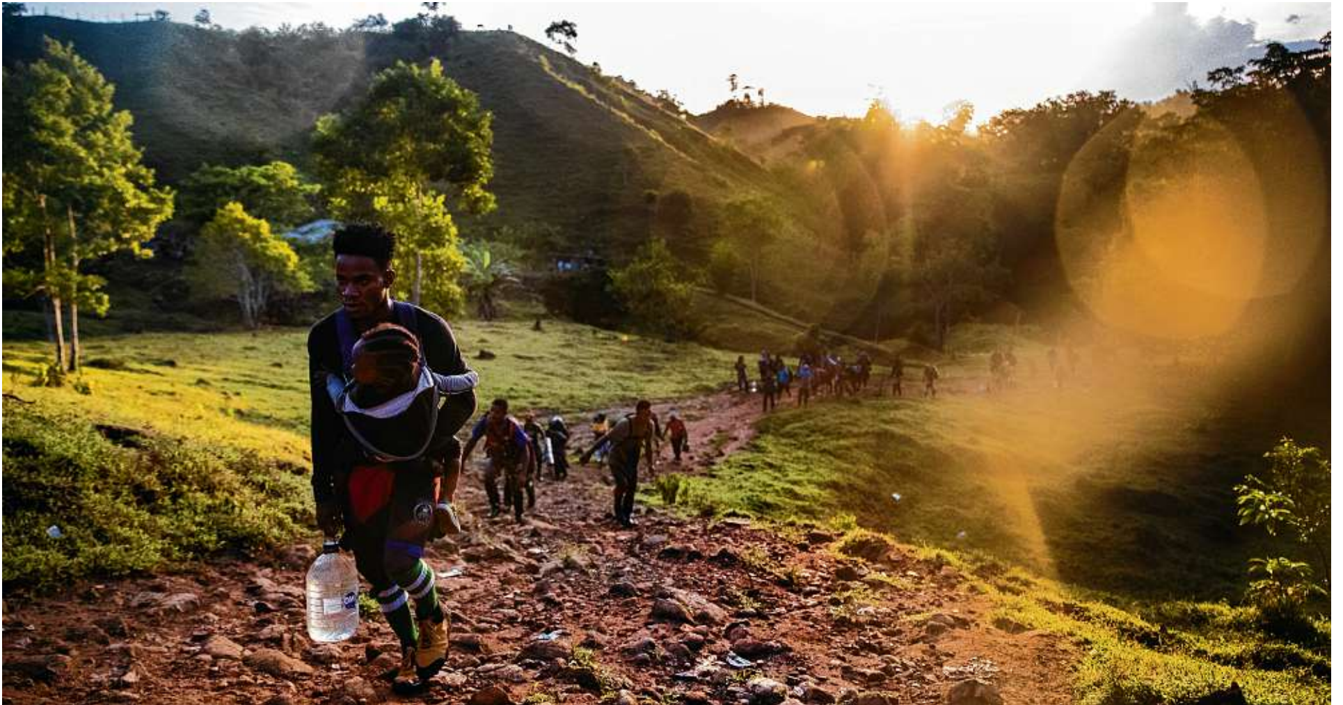
About 90 migrants leave the Las Texas camp in Acandí, Colombia, to enter the jungle of the Darién Gap, the only way to reach North America by land, on Nov. 6.

The arrival of thousands of migrants at Del Rio last year was the end of a long, perilous journey through South and Central America