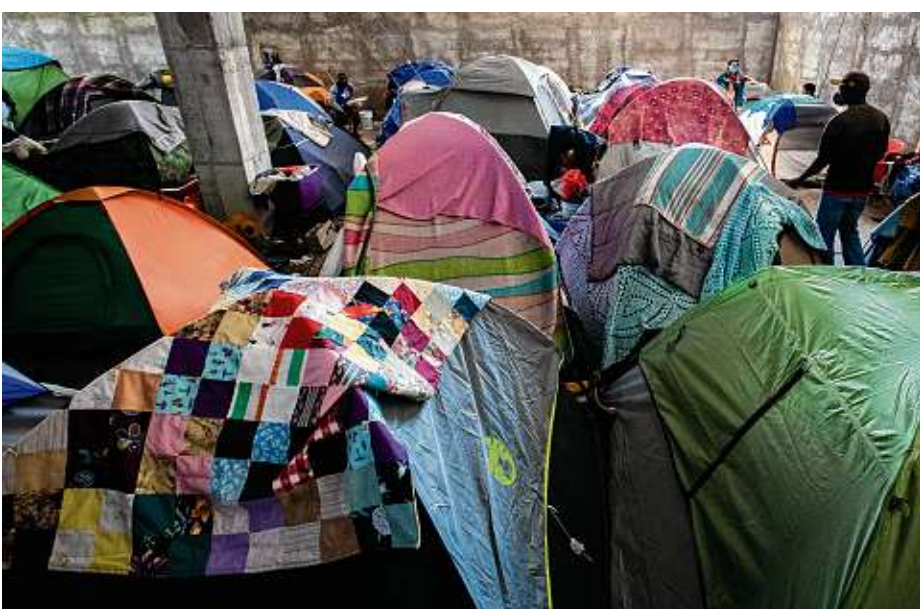
Dozens of tents serve as makeshift rooms for hundreds of migrants at Terraza Fandango shelter on Nov. 19 in Ciudad Acuña, Mexico, across from Del Rio.