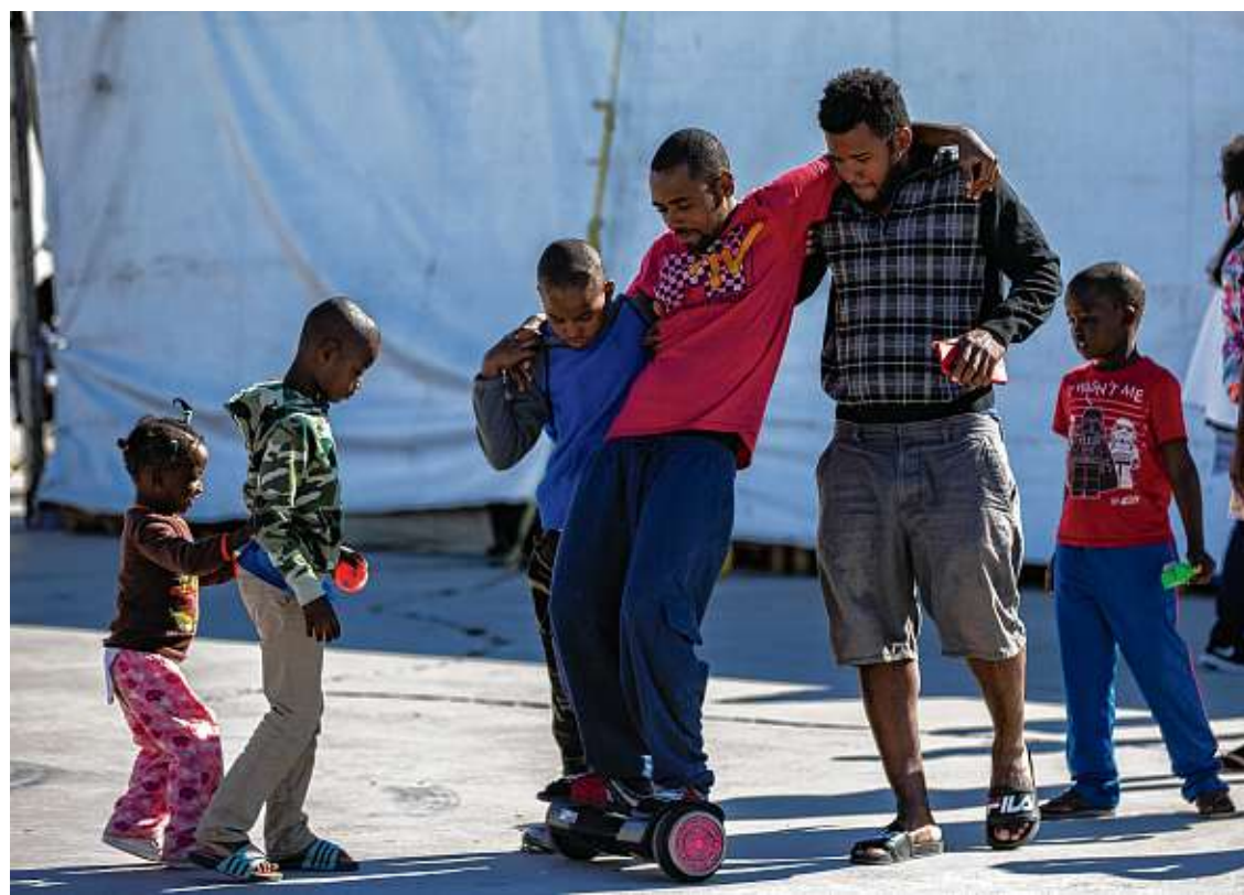
Migrants try to ride a hoverboard at the Terraza Fandango shelter, about a mile from the Del Rio International Bridge in Ciudad Acuña, on Nov. 19.

He recalled that after the long journey to the border, he was