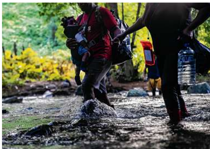
Migrants cross the Río Muerto on Nov. 6 as they enter the Darién Gap jungle. Numerous travelers do not make it out.

With the help of a Colombian woman managing one of the makeshift shops at the remote camp, without access to a doctor, hospital or pain medication,