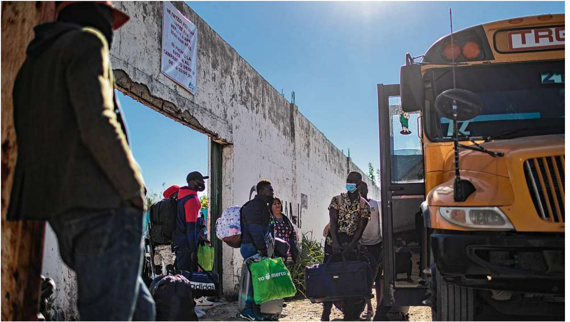
Many Haitian migrants in Ciudad Acuña decided not to cross the Rio Grande into Del Rio, risking deportation to their country, and instead sought asylum in Mexico.