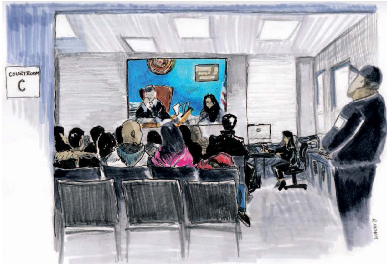
ILLUSTRATION BY RYAN HENRY/THE BROWNSVILLE HERALD

Above: In this courtroom sketch, an immigration judge presides via a video conference monitor over cases of asylum seekers gathered in Courtroom C on Friday at the immigration tent courts at Gateway International Bridge in Brownsville. No cameras are allowed inside. Below: A banner with "Rigged Courts Are Not Due Process" is strung between a tree and a post Thursday, across from the tent courts outside Gateway International Bridge.