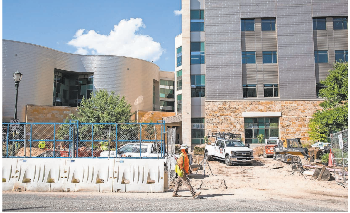
Fifteen years ago, Dell Children's Medical Center opened its doors in Austin. It continues to grow and to expand its programs.